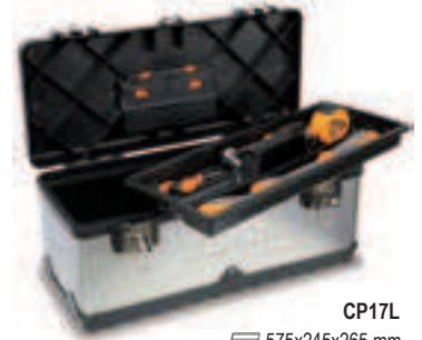
CP17L 575x245x265 mm