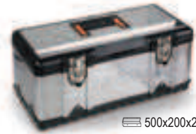
CP17 500x200x220 mm

tool box, made of stainless steel and plastic, removable tote-tray